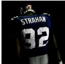
Going Out On Top, On Time