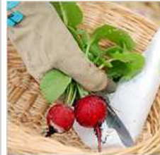
When Money Is Tight, Banking on Gardening