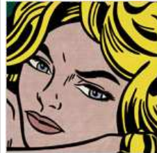
The Painter Who Adored Women