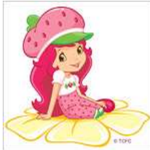
Characters Reimagined for the 21st Century